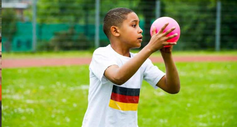
SPORT SPEAKS ALL LANGUAGES