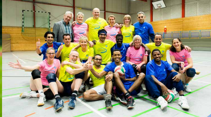
LEAD AND TRAIN