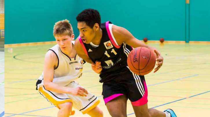
FINDING YOUR ROLE