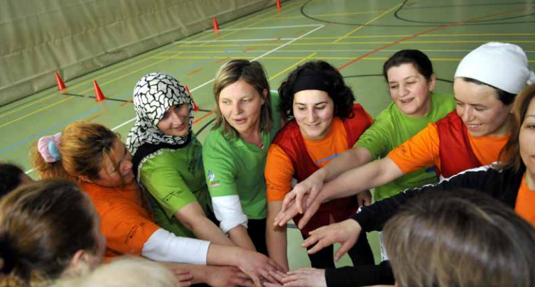
SIMPLY FEELING AT HOME